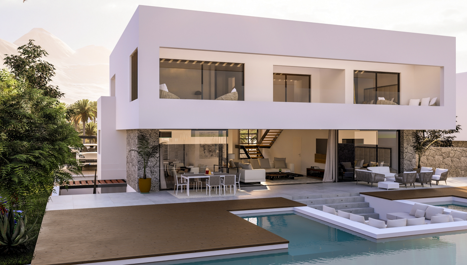
Property photo 1