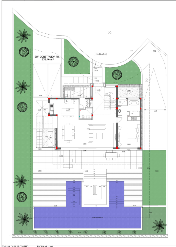
23-0189_CASA 03 CORTIJO ESCALA=1 : 100